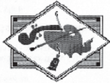
Arts & Communications